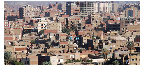
Cairo, Egypt Residential Area