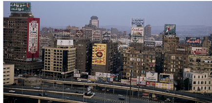
Cairo, Egypt City Center

• Discuss the contrast between wealthy and poor urban dwellers in ONE city found in the periphery or semi-periphery - _____